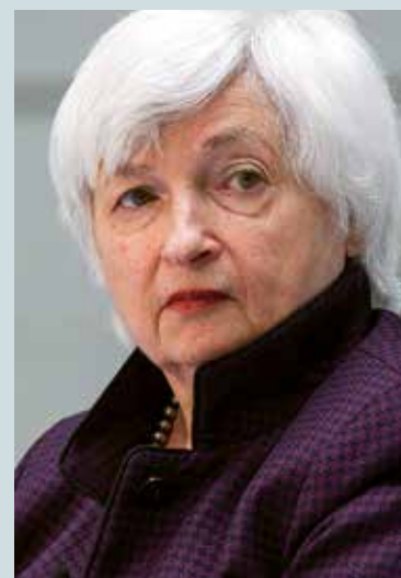
U.S. Treasury Secretary Janet Yellen