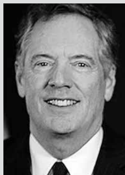
Robert Lighthizer, nominated for U.S. Trade Representative, who approved China’s entry into the World Trade Organization.