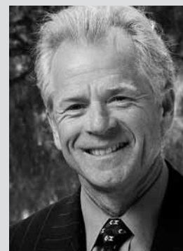
Peter Navarro, director of the newly formed National Trade Council, who attacked China for currency manipulation and the production of dangerous products.

flag for Wall Street, Trump’s personnel picks surely should. At the Commerce Department, there’s billionaire investor Wilbur Ross, a trade hawk whom The Economist nicknamed “Mr. Protectionism.” The nominated U.S. trade representative is Robert Lighthizer, a combative trade lawyer and former deputy U.S. trade representative under President Ronald Reagan who opposed China’s admission into the World Trade Organization.