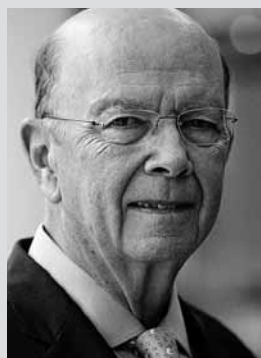
Wilbur Ross, confirmed as U.S. Secretary of Commerce, whom The Economist nicknamed “Mr. Protectionism.”