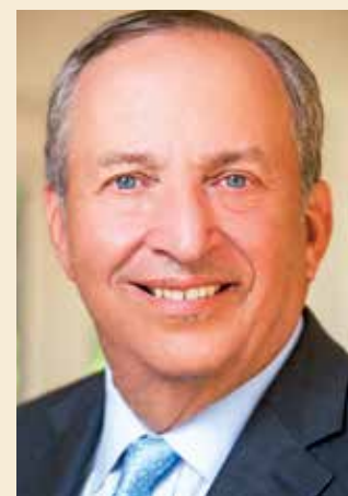
Former Treasury Secretary Larry Summers

“Everybody was aware that there were a lot of transitory factors. Everybody was aware that there were short-term bottlenecks. Nobody predicted anything like recent CPI or average hourly earnings figures. So, I think you’ve got to say that whatever one thought three months ago, the inflation view has got to look considerably more plausible today that it did then.”