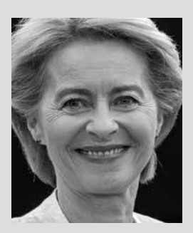
Ursula von der Leyen, former German defense minister, is the incoming European Commission president.

acron needed room among the European top jobs for four highly qualified people—he had promised to fill two of the jobs with women—who were likely to advance not only European interests, but also could be expected to work with "a French connection" in the coming years.