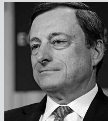
Former ECB President Mario Draghi

other factors in the real sector, or the ECB’s monetary policy, or a mixture of these? There are substantial economic arguments with which to criticize the ECB’s expansive monetary policy (the GCC ruling concerns the period before the corona crisis). But has the ECB thereby exceeded its mandate?