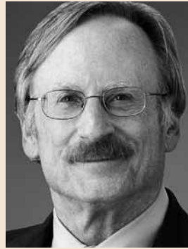
MICHAEL J. BOSKIN

What we need instead is a much more complicated policy mix, which rests on three pillars: first, bringing private and public debt back to sustainable levels; second, implementing more sustainable growth-enhancing policies, which should target investment in infrastructure and innovation; and third, not depending on growth alone, since many policy problems cannot be solved by means of higher GDP growth, but instead demand policies of sustainable resource utilization and intelligent countermeasures against rising inequality, such as increased public expenditure on extending educational opportunities.