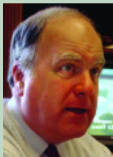
Rep. John Spratt (D-SC)