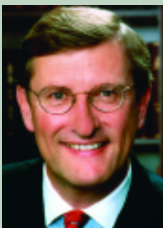
Sen. Kent Conrad (D-ND)