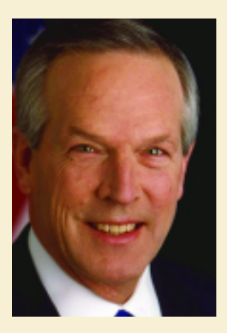
Commerce's Don Evans: The outside man and major counterweight to the Bush free traders. Smooth talker, no policy heavyweight, but effective communicator.