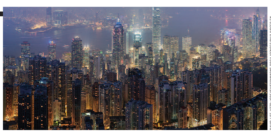
The main test-bed for gradual liberalization of the RMB is Hong Kong.

urning to consider future possible reserve currencies, what would have to happen for the Chinese RMB to emerge as an international reserve currency?