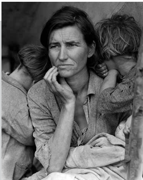
DOROTHEA LANGE, “MIGRANT MOTHER” (1936)

When the jobs have been shipped overseas, fiscal stimulus does not call workers back to work in order to meet the rising consumer demand. If fiscal stimulus has any effect, it stimulates employment in China and India.